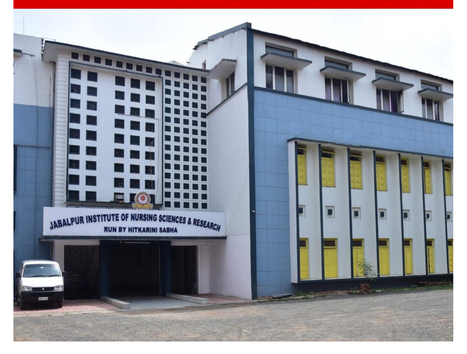
Criterion 1 – Curricular Aspects

Timing 10:00 AM to 5:00 PM (Mon - Fri) , 10:00 AM to 1:00 PM (Sat) , Sunday Closed